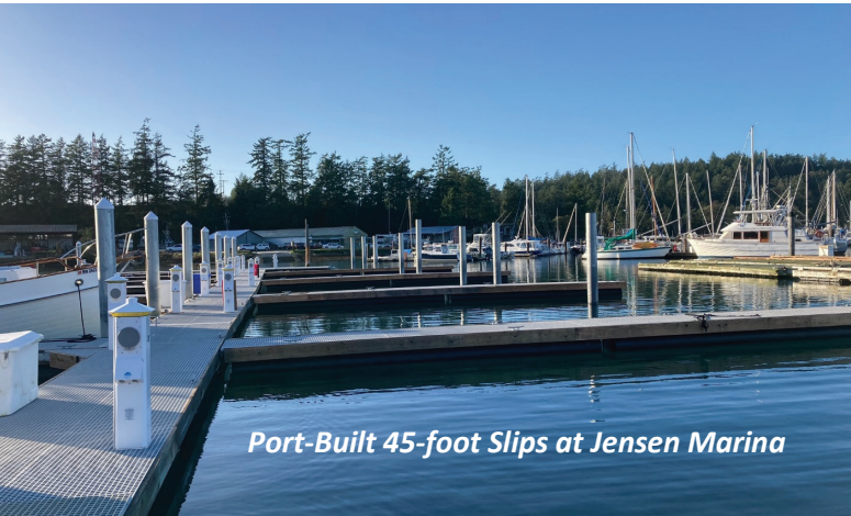
Port-Built 45-foot Slips at Jensen Marina

Applying for state and federal grants, along with executing the work according to their conditions, is a significant administrative task. Despite the effort involved, grants play a major role in delivering important infrastructure to the community. In 2023 the Port acquired approximately $4M of external funds to create and repair critical infrastructure. This level of funds is nearly equal to the revenue created from the Port’s combined assets and has a far lower cost to deliver. Diligently pursuing grant funding remains a top priority for Port staff.