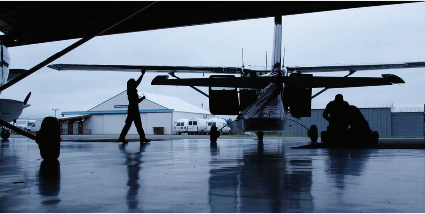
Flight Crew Prepares Island Air’s Cessna 208 Turboprop Air Ambulance for Takeoff at the Friday Harbor Airport

Comment on or participate in a discussion of the Port Commission remotely? Email questions or comments 48 hours in advance of Port Commission meeting to Todd Nicholson: toddn@portfridayharbor.org . You may listen but not comment in on ZOOM. ZOOM links are included with agendas posted on the Port website www.portfridayharbor.org .