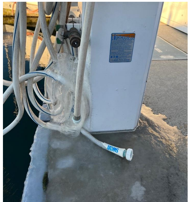
Broken hose bibs became a nuisance during the cold weather

So next time you see one of our maintenance crew in their bright orange work-vests down on the dock, be sure to thank them for their amazing work at keeping the marinas we love fully functional!