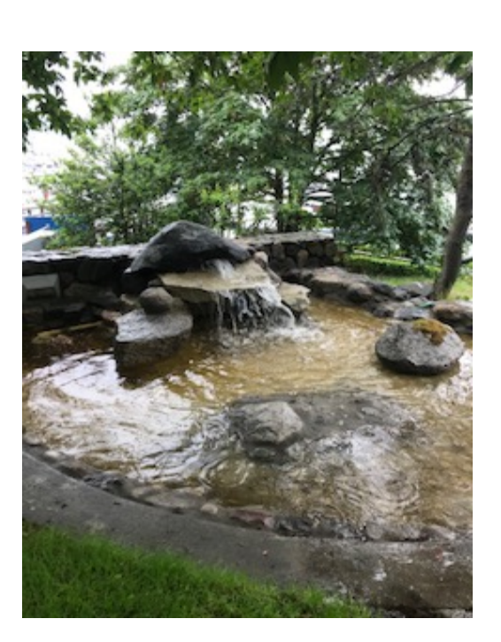
Main Marina pond