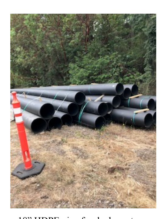
18" HDPE pipe for dock pontoons

The real change for us at the Port is our ability to fabricate our own docks, and dozens of other projects that have been routinely outsourced. The maintenance section has added staff that have exceptional skills in welding and fabrication. You will see their handiwork everywhere you look.