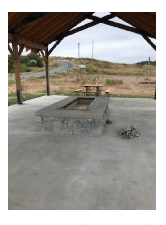
New Jackson's Beach Shelter fire pit