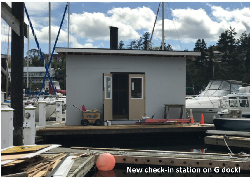
New check-in station on G dock!

Save the date for two great back to back events at the Friday Harbor Marina! The Rock & Roll Regatta will be a two-day event on June 28th and 29th, and Rock the Dock on July 4th. There will be live music, food, drink, and activities for all ages!