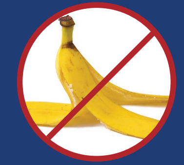
FOODS, LIQUIDS & GARBAGE GO TO THE LANDFILL

Recycling contamination occurs when people try to recycle the incorrect materials or when the proper materials are not correctly prepared. It can result in an entire shipment being rejected and placed in the landfill.