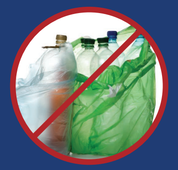
REMOVE ALL PLASTIC BAGS