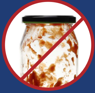
REMOVE ALL LIDS, RINSE JARS & CANS