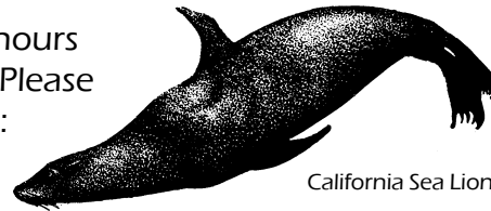
California Sea Lion